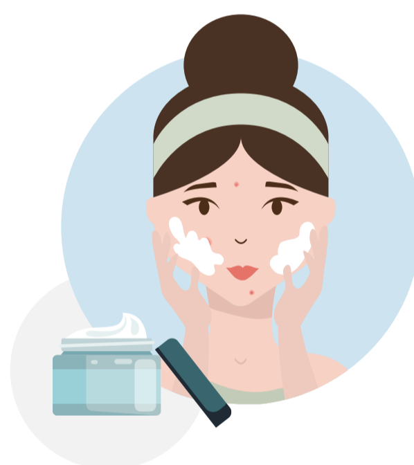
CREAMS & SERUMS

Common active ingredients for effective topical acne treatments include benzoyl peroxide, salicylic acid and azelaic acid, used individually or in combination.