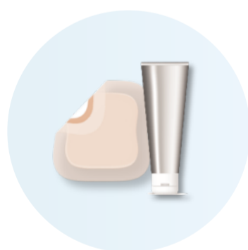
Advanced Wound Care