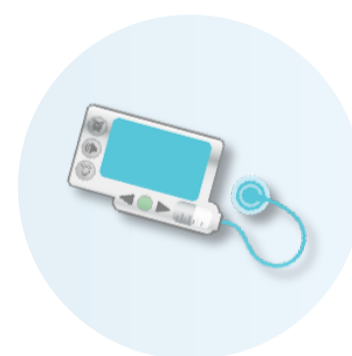
Medical Device Fixation

Our goal is to help our customers introduce innovative products to market rapidly.