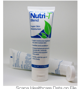
Scapa Healthcare Data on File