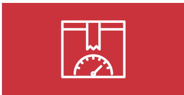
SPEED TO MARKET