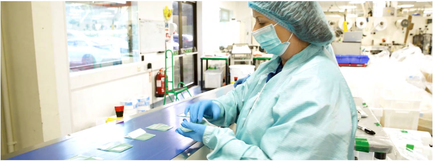
Scapa Healthcare Hydrogel Technology Center in Ramsbury, U.K.