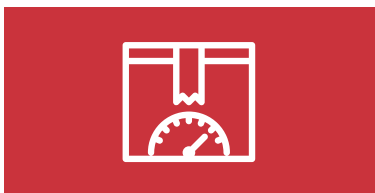
SPEED TO MARKET