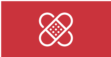
HYDROGEL-BASED ADVANCED FIRST AID WOUND DRESSING

Additionally, Scapa Healthcare’s quality management systems and medical device certification are valuable resources to the customer. The Knoxville team thoroughly understood the regulatory requirements to manufacture this medical device and was able to accommodate the customer’s specific regulatory requirements to be able to sell the dressings in international markets.