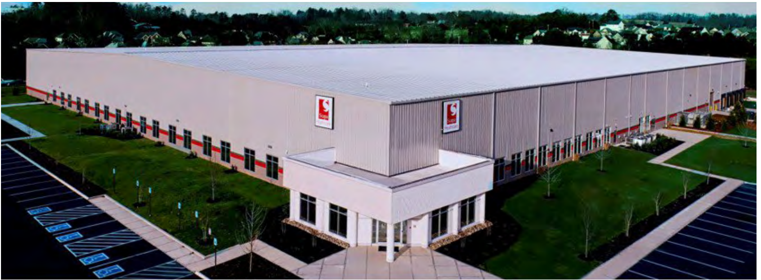
Scapa Healthcare's Turnkey Center of Excellence in Knoxville, TN