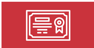
QUALITY MANAGEMENT SYSTEMS AND MEDICAL DEVICE CERTIFICATION